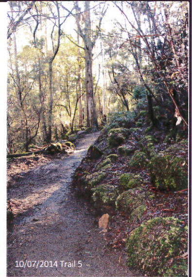
10/07/2014 Trail 5

Visit Dorset Council's website, http://www.dorset.tas.gov.au/mountain-bike-trails/ to see photos.