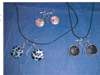
MTB Necklaces, Earrings & Key rings available at Hobbyts Dragon

Facebook posts and photos are regularly popping up from Derby locals who are out walking the trails and keeping a close eye on construction. Great job guys! Keep it up, and enjoy the walks....soon be time to get the bikes out!