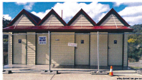
Derby's new Public Toilets

Situated at street level above the Tin Dragon Interpretation Centre and Café they are easily accessible and, judging by the amount of vehicles already stopping (and they haven't opened yet) they'll be a popular addition to the town. Due to open in October!